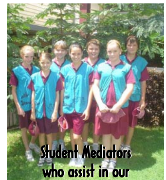
Student Mediators who assist in our Positive Playground Program.